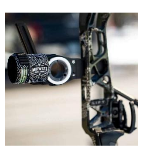
Dark Owl Archery Stealth 31 and Stealth 41 Precision Performance and Adaptability