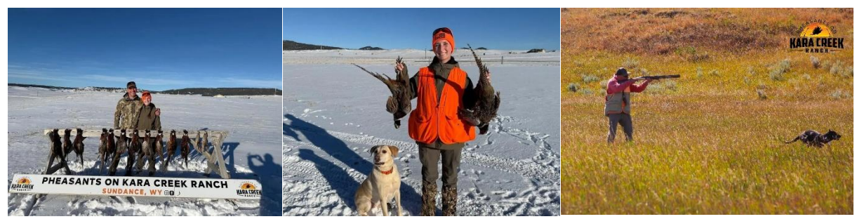
Kara Creek Pheasants and Chucker, 4 hunters 1 day of hunting Near Sundance Wyoming

The following are some photos of hunts that the Greater Dacotah Chapter has to offer at the 2025 Banquet and Auction: