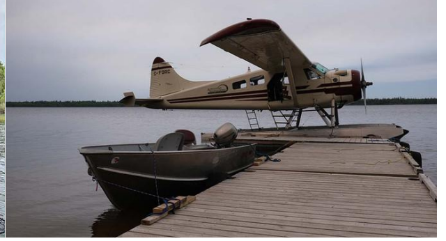
Twin Falls Lodge Saskatchewan Canada for 2 people 3 days & nights northern pike and walleye