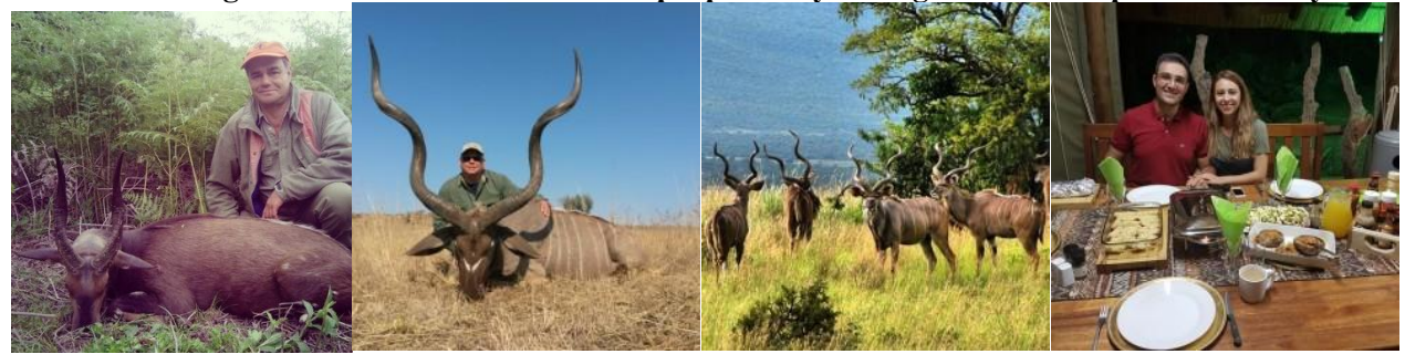
Aloe-Africa-Hunting Zulu Natal South Africa for Greater Southern Kudu & Bushbuck